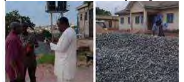
Ifako-Ijaiye CDC town hall project

To achieve huge success, he said the committee inaugurated two sub-committees - the Fund Raising committee and the Building committee to generate funds and build a