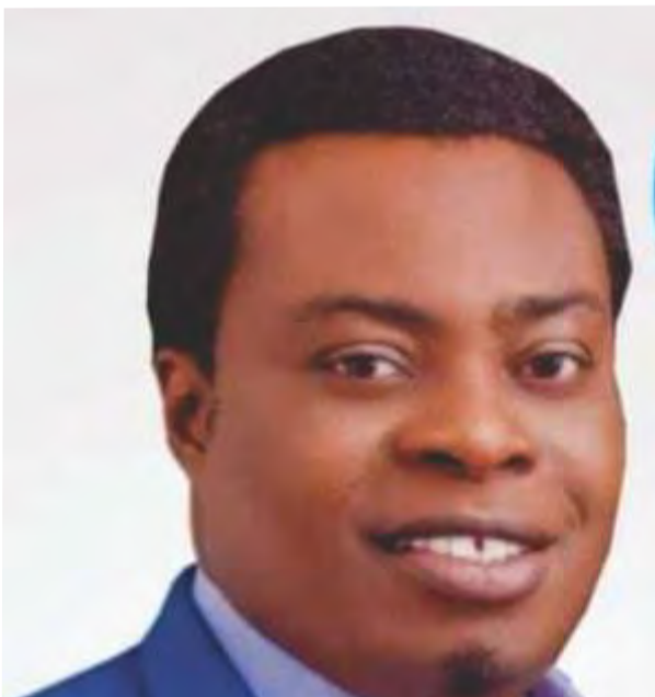
Hon. Olusegun Ege

The Newly elected Lagos State House of Assembly member representing Ojo constituency I, Comr.