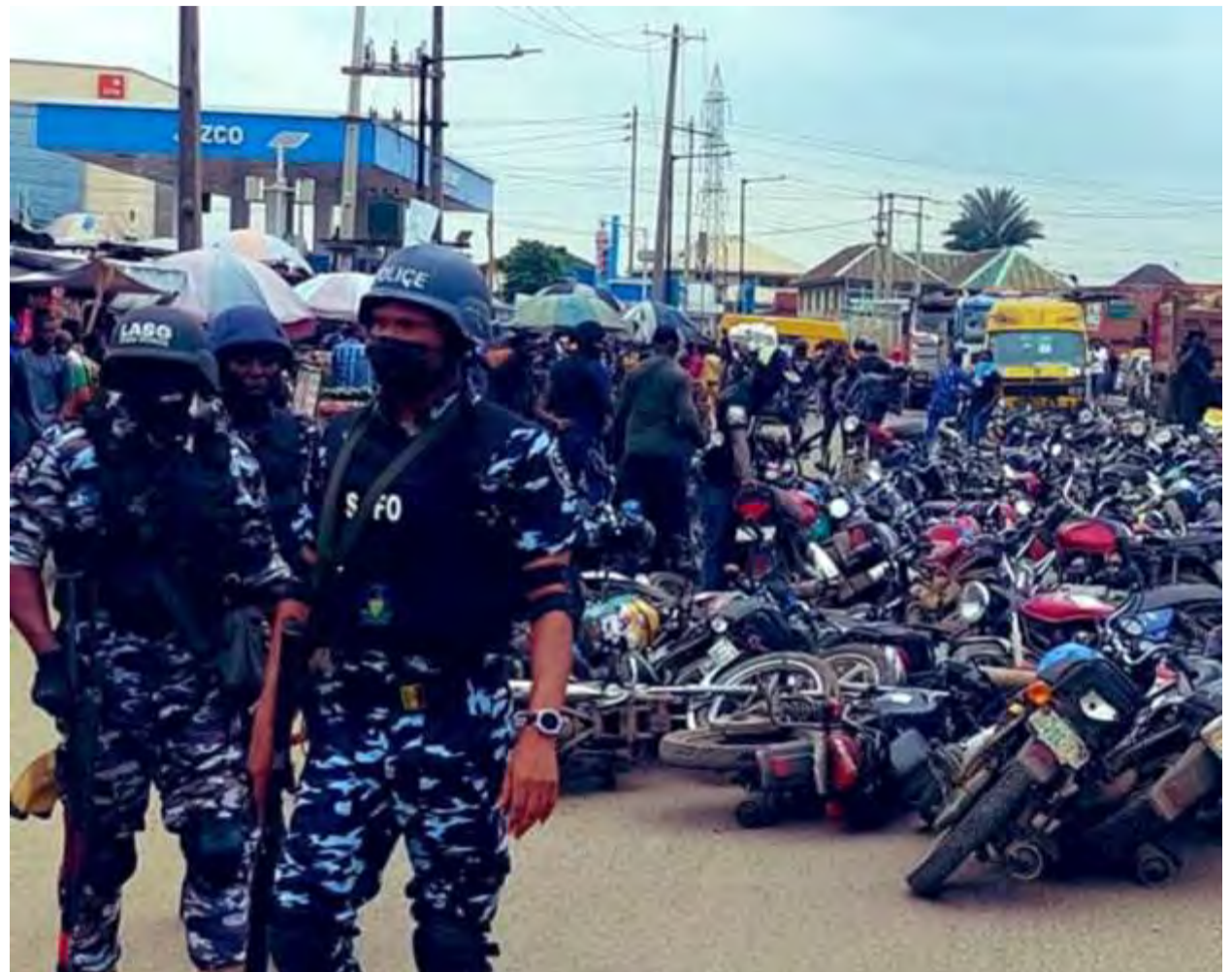
Men of the Nigeria Police with seized motorcycles

The Special Adviser averred that the Security Agencies who have been partnering with the State Government, including the Nigeria Police Force, the Army, Navy and Air force, are still prepared to sustain enforcement on all the banned corridors, this is in addition to the operations of the State Traffic Management Authority (LASTMA) and the Anti-Okada Squad.