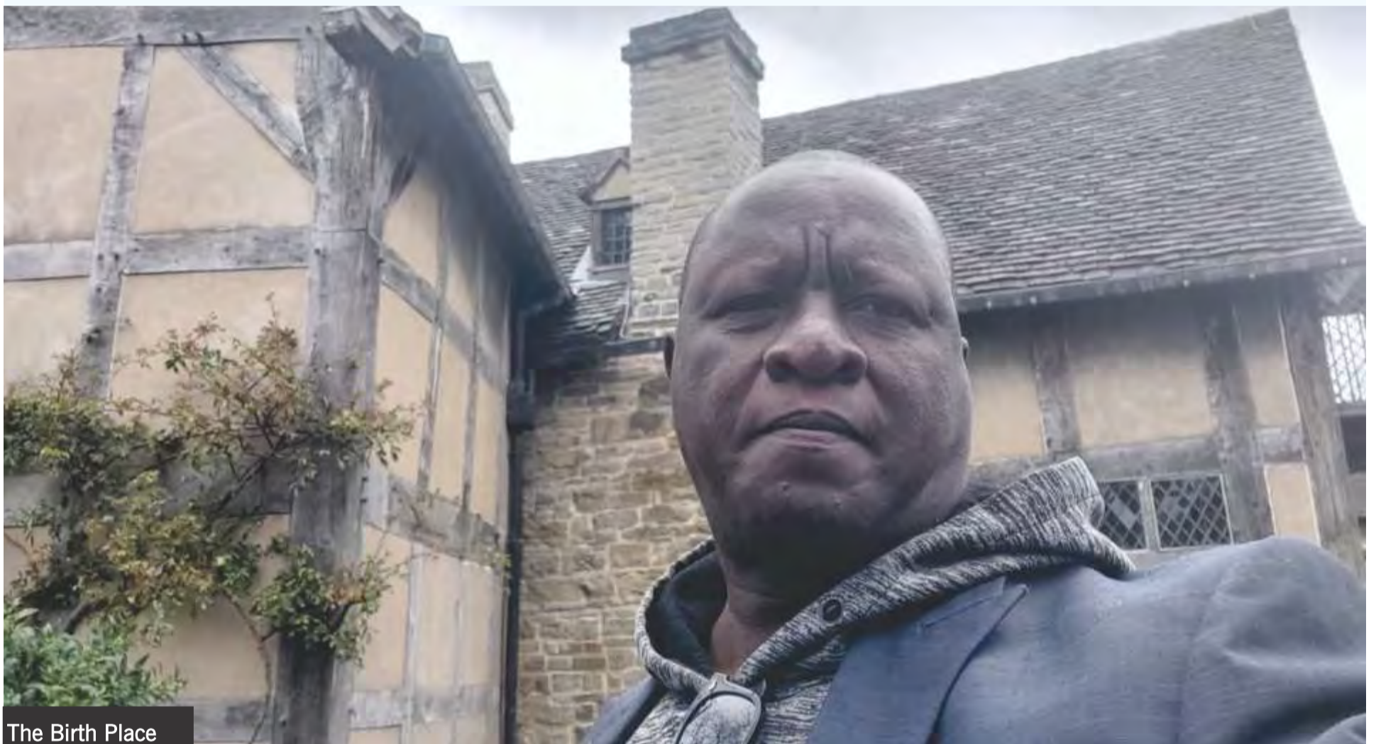
The Birth Place

hundreds flock to the birthplace to experience the habitat that produced the everlasting genius. Lying in the grave at the nearby church, unaware of tourists, witnessing his last abode, Shakespeare might want to utter a popular line from Aa You Like It: "All the world's a stage, and all the men and women merely players' (Act 2, Scene 7).