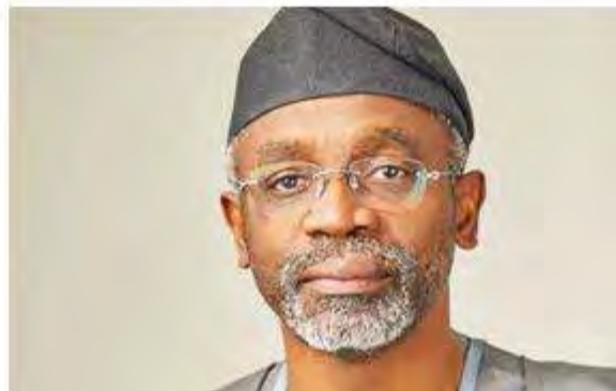
Rt. Hon. Femi Gbajabiamila