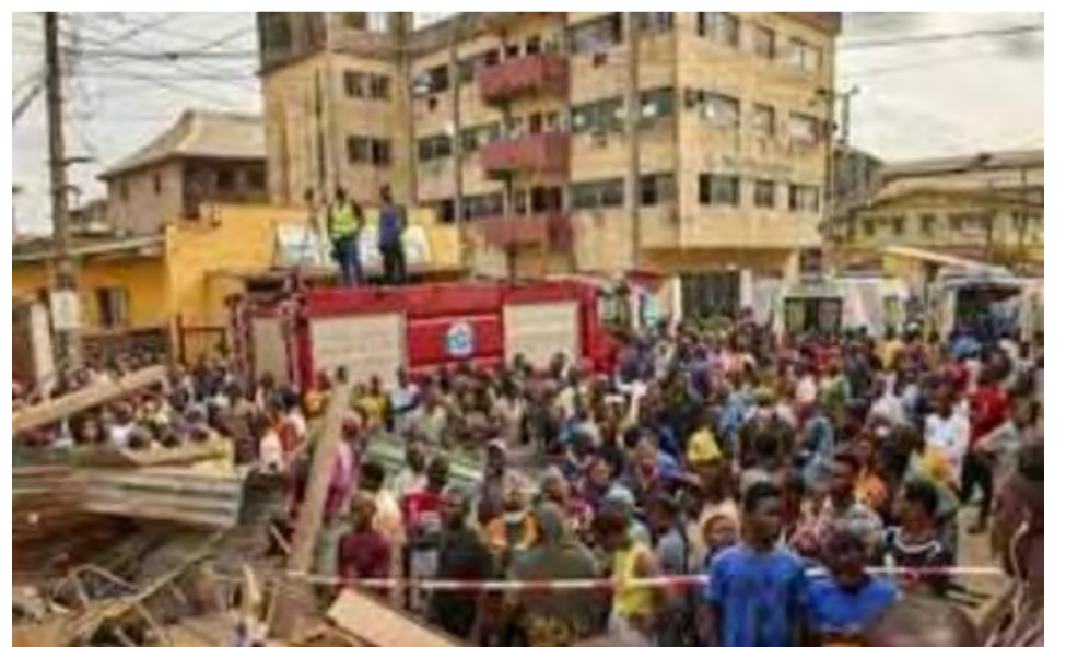
Some of the buildings

provisions of the Law, adding that in the event that LASBCA removes the structures, cost of demolition will be borne by the owner/developer of the structures. He also urged all owners/developers to carry out detailed maintenance checks on their properties and obtain the Certificate of Completion and Fitness for Habitation for new and existing buildings that are yet to do so in line with the building codes of the State.