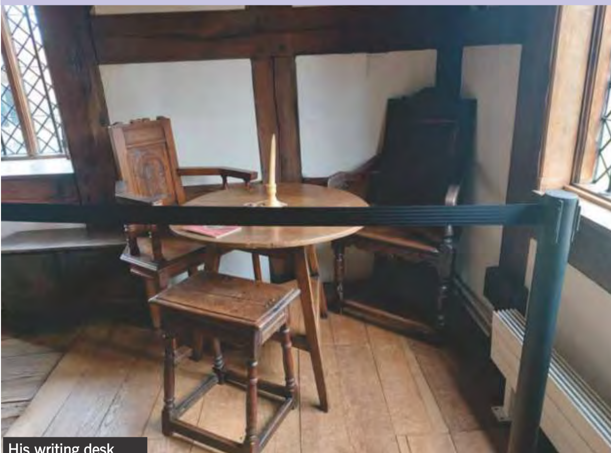
His writing desk