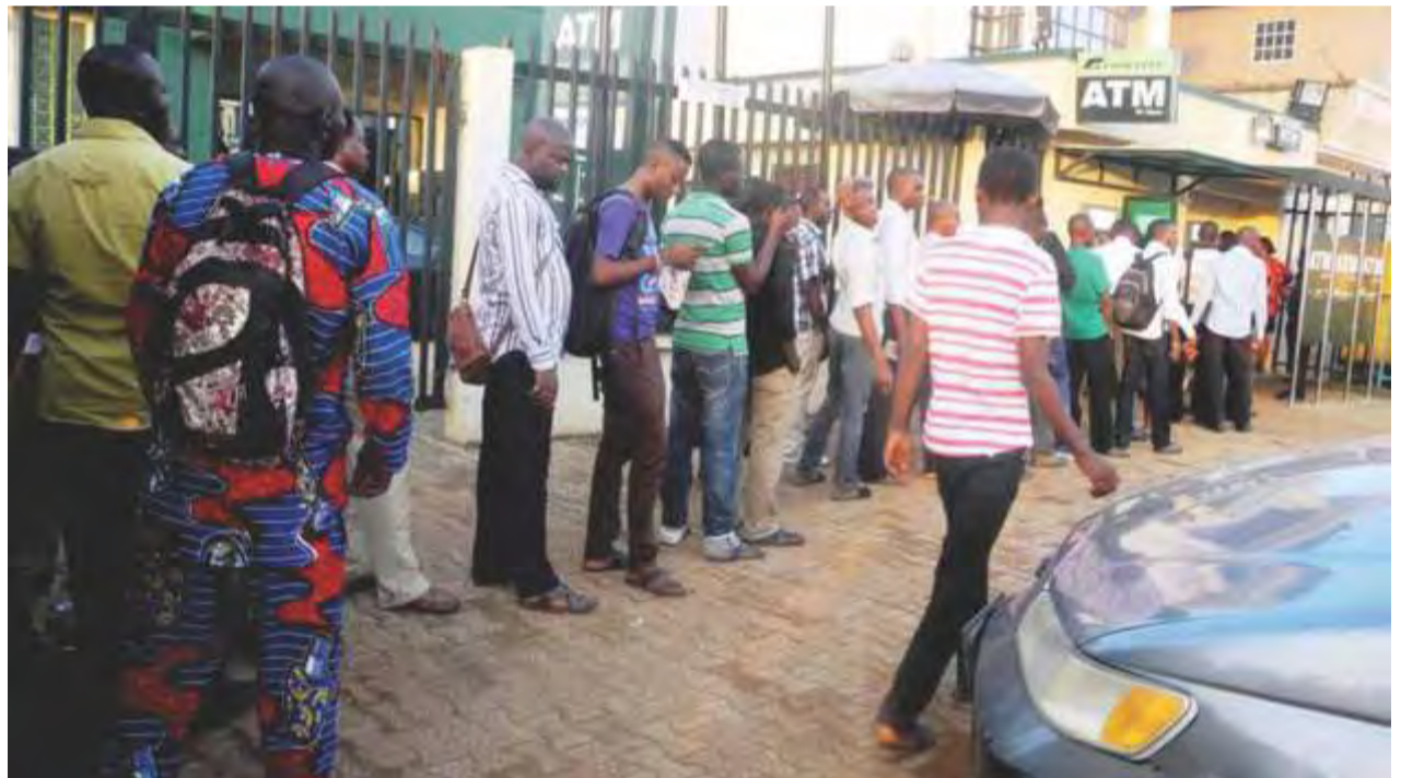
Customers waiting to get cash from an ATM

She said the fintech ecosystem will also need to be upgraded while the online payment banks also need to expand their capacities to accommodate the increasing number of customers.