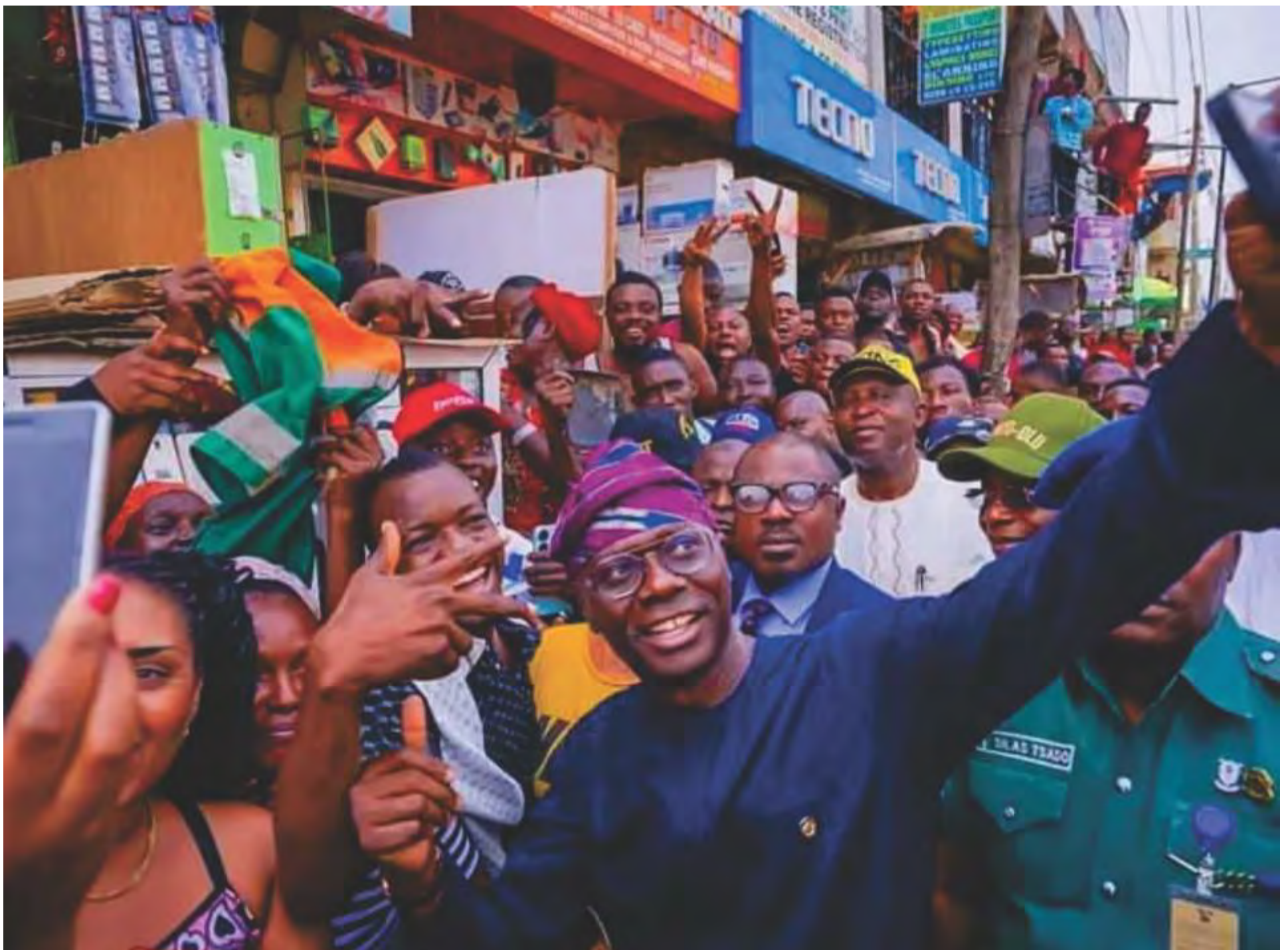
Governor Sanwo-Olu during his visit to markets

His presence converged the party's chieftains and allowed him to broker peace among the aggrieved ones. He also pleaded with the aggrieved party agents and voter's canvassers to sheath their swords and work for the victory of APC