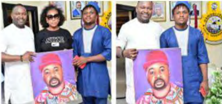
Art craft training for Oshodi youths.

O shodi-isolo Local Government in partnership with Elijah Art Academy and Gallery has planned to train young talented artists within the