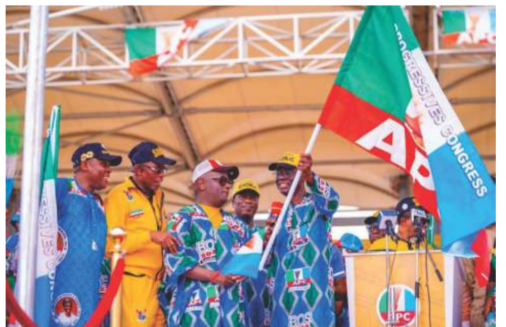
Gov Sanwo-Olu during campaigns in Lagos

The house-to-house campaign was an idea that worked because most of Lagos residents who spoke to our correspondent a week after the presidential election said that their choice of governor would be based on past performance, experience and competence.