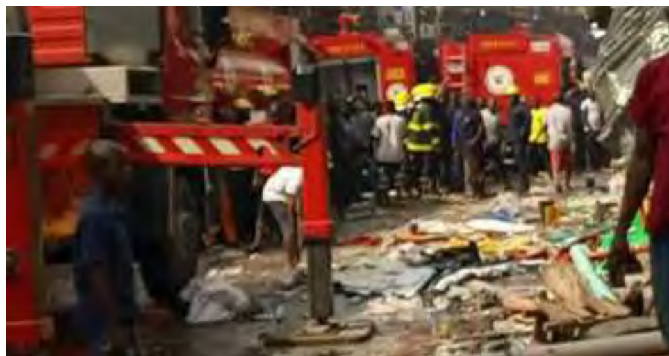
The part of Balogun market that was razed with fire