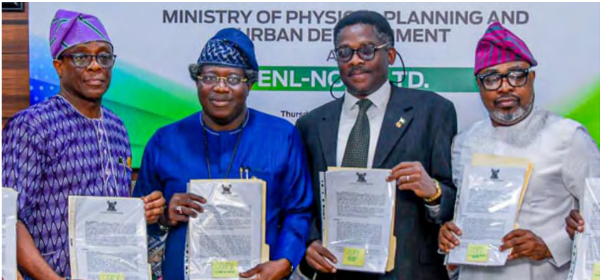
Ministry of physical planning at the contract signing ceremony

Lagos State Ministry of Physical Planning and Urban Development on Thursday signed a contract with ENL-NOVA Ltd for the use of the Electronic Physical Planning Processing System (EPPPS) to bring about positive change for land administration in the State.